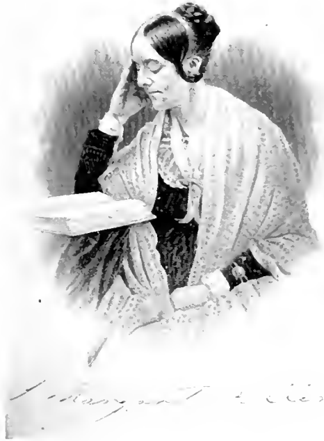
SARAH MARGARET FULLER OSSOLI.

OSSOLI, Mme. Sarah Margaret Fuller, educator and philosopher, born in Cambridge, Mass.,